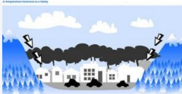
A temperature inversion in a valley – clean air poster from a Teacher's Guide to Clean Air by BC Transit, Nov. 2005 – republished permission Ministry of Environment, British Columbia Canada

PM, as well as gaseous air pollutants, tend to concentrate in valleys due to containment by topographical features. (HEI Review, supra) Inversions, in which a layer of cold air is trapped underneath a layer of warm air, keep PM concentrated near ground level and aggravate the concentration of PM in valley and canyon floors. Ibid. Fog is often an indicator of an inversion.